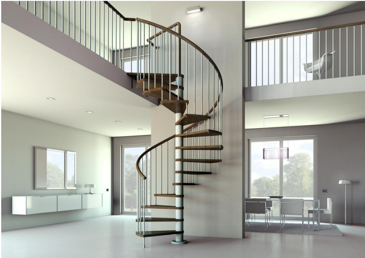
Wooden Spiral Staircase Type "Capri Plus"