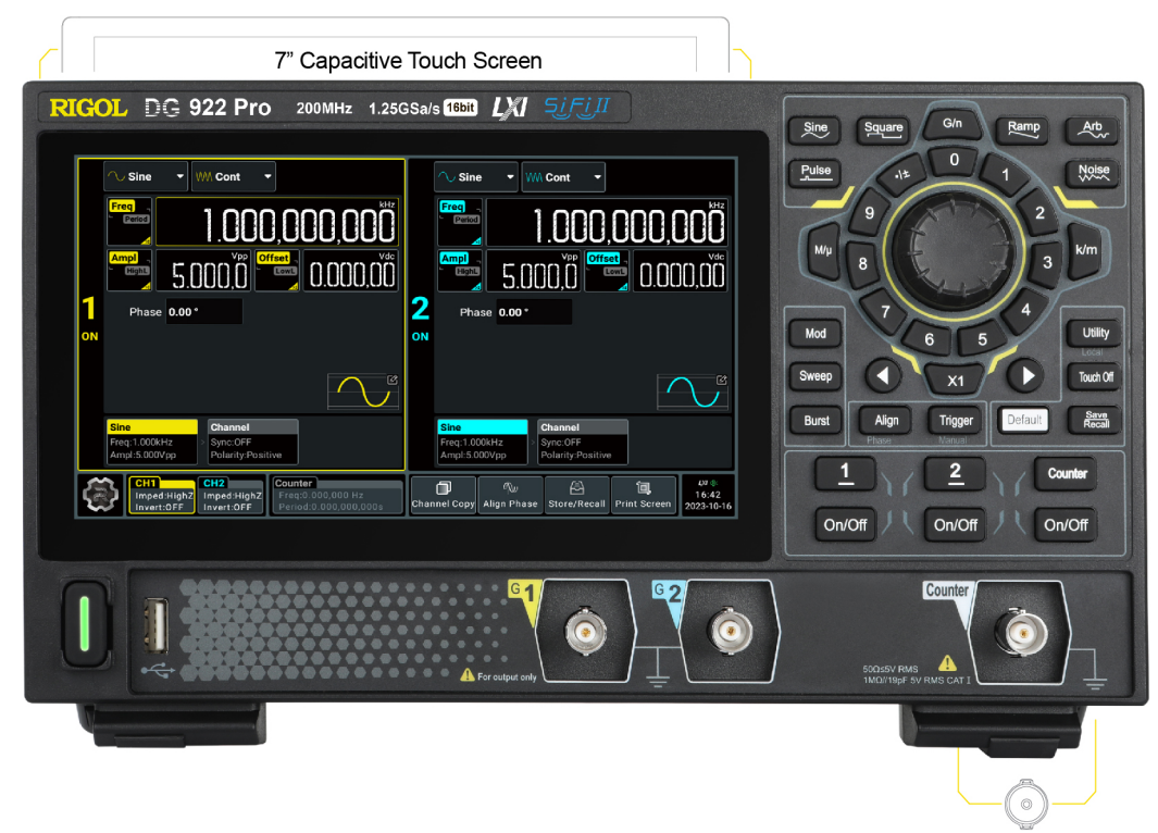
Independent Counter Input Terminal