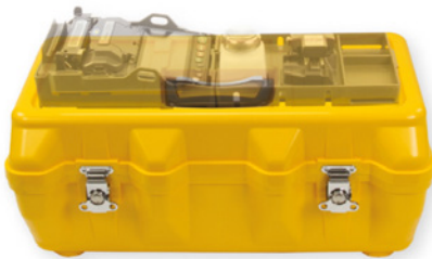
Workstation on Transit Case