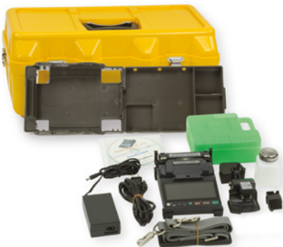
Fujikura 22S Kit 1