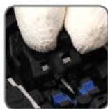
Simply exchange of electrodes