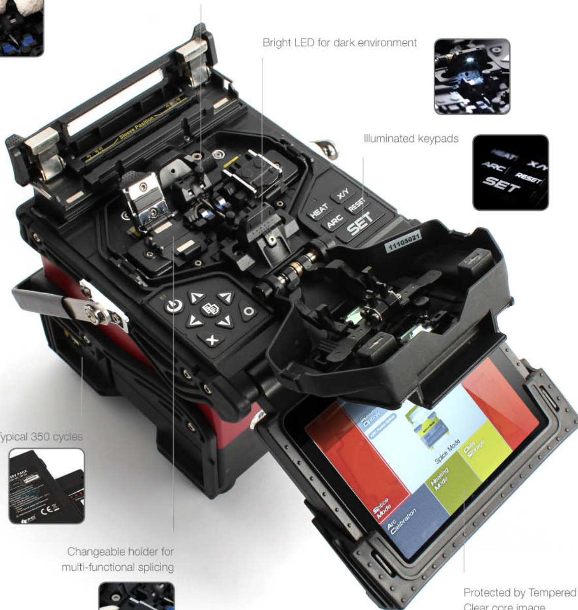
Battery : Typical 350 cycles