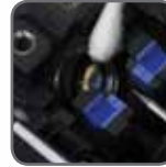
Easy to clean mirrors