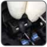
Simply exchange of electrodes