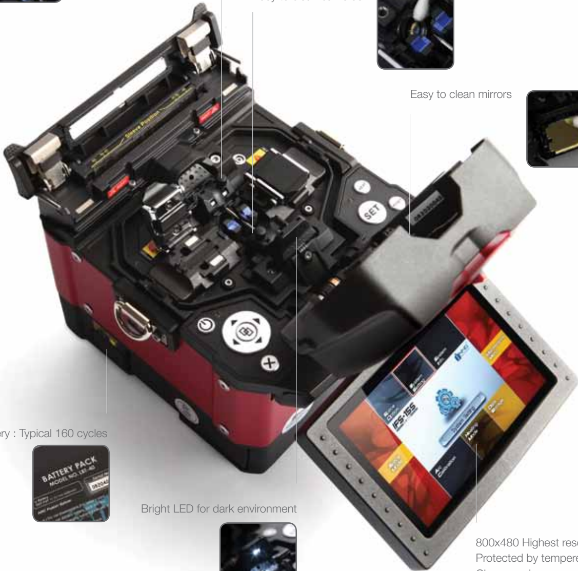
Battery : Typical 160 cycles