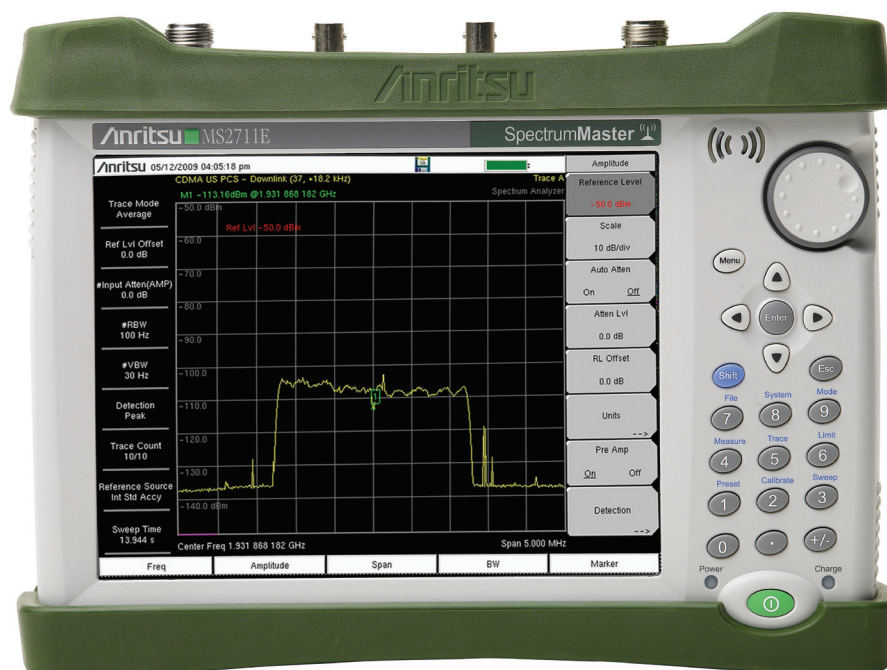
Spectrum Master™ MS2711E Spectrum Analyzer featuring 8.4" Daylight Viewable Touchscreen Compact Size: 273 mm x 199 mm x 91 mm, (10.7 in x 7.8 in x 3.6 in), Lightweight: 3.45 kg, (7.6 lbs)