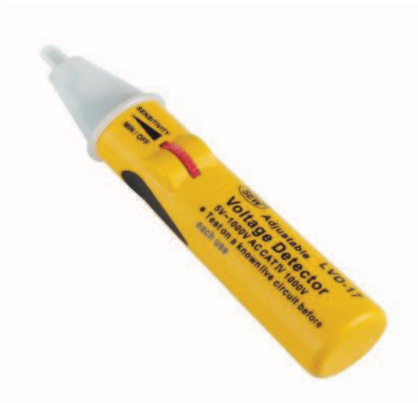
Adjustable non-contact VOLTAGE DETECTOR LVD-17