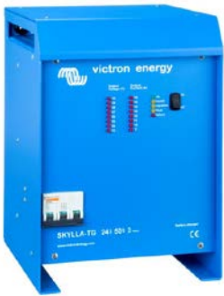
Skylla TG 24 50 3 phase

To learn more about batteries and charging batteries, please refer to our book 'Energy Unlimited' (available free of charge from Victron Energy and downloadable from www.victronenergy.com ).