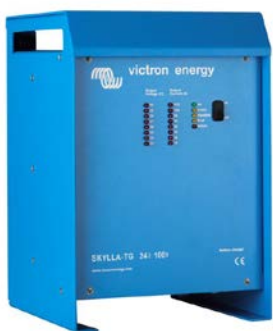
Skylla TG 24 100