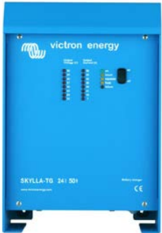
Skylla TG 24 50