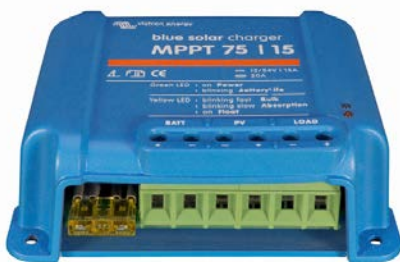
Solar Charge Controller MPPT 75/15