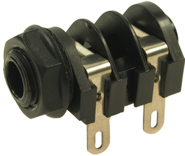
S2/BNB Solder Tag